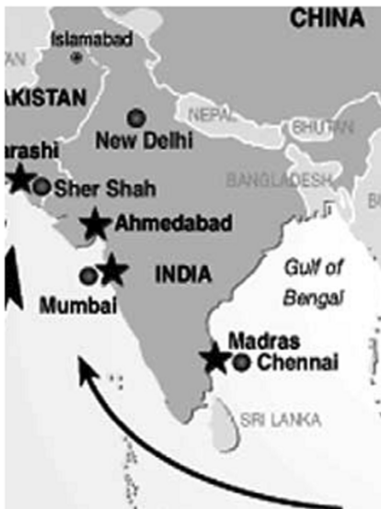
Figure 2 Major Indian ports receiving E-waste.

Over 1 million poor people in India are involved in the manual recycling operations of E-waste and most of the people working in this recycling sector are the urban poor with very low literacy levels and hence very little awareness regarding the hazards of e-waste toxins. There are a sizeable number of women and children who are engaged in these activities and they are more vulnerable to the hazards of this waste. The following three categories of WEEE account for almost 90% of the generation: