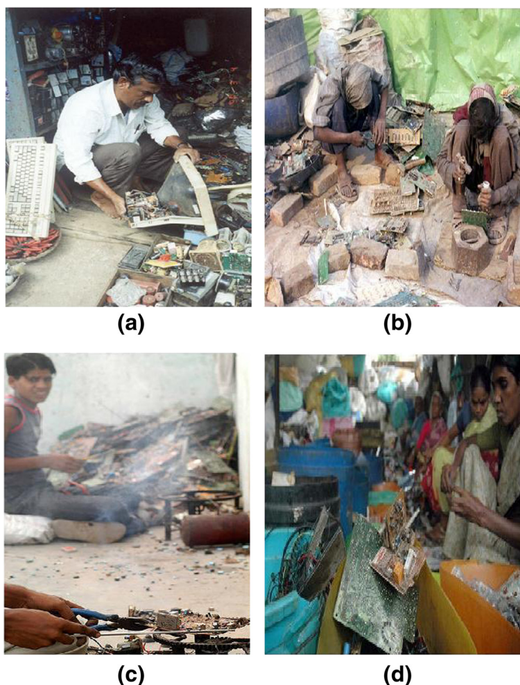
Figure 3 E-waste recycling units in India. (a): E-waste dealer sorting through waste in Chennai. (b): Children recycling toxic e-waste with their bare hands, Delhi. (c): Children extract copper from discarded computer parts. New Delhi. (d): Women working in recycling toxic e-waste with their bare hands.

is used when old WEEE are exported to developing countries and they are often labeled as “second-hand goods” since the export of reusable goods is allowed. On the other hand, most WEEE that does work on arrival only have a short second life and/or are damaged during transportation. The main objectives of the Basel Convention are: